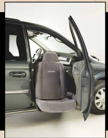
TURNING AUTOMOTIVE SEATING™ (TAS™)

Founded 25 years ago, Bruno Independent Living Aids, Inc., is a world-wide manufacturer of accessibility products designed to enhance the lives of those challenged by limited mobility. In pursuing this goal, Bruno is proud to be the only U.S. manufacturer of indoor/outdoor stairlifts, interior/exterior scooter, powerchair and wheelchair vehicle lifts and Turning Automotive Seating™ (TAS™) products to be ISO 9001 Certified. This is one of the most stringent, widely-recognized quality standards in the world and your assurance that Bruno is committed to providing you with the highest-quality, most reliable products in the industry. Ask your certified Bruno dealer for details on all Bruno independence products.