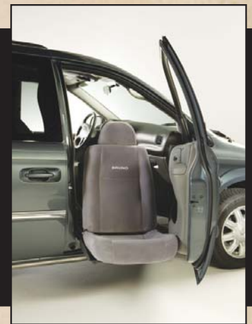
TURNING AUTOMOTIVE SEATING™ (TAS™)

The only 400 lb/181.8 kg capacity outdoor stairlift... an INDUSTRY EXCLUSIVE!