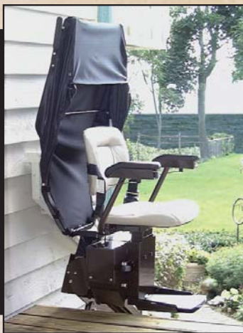
OUTDOOR ELECTRA-RIDE™ ELITE Model SRE-2000E

Home accessibility solutions and automotive products