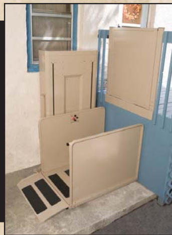
VERTICAL PLATFORM LIFT Model VPL-3100